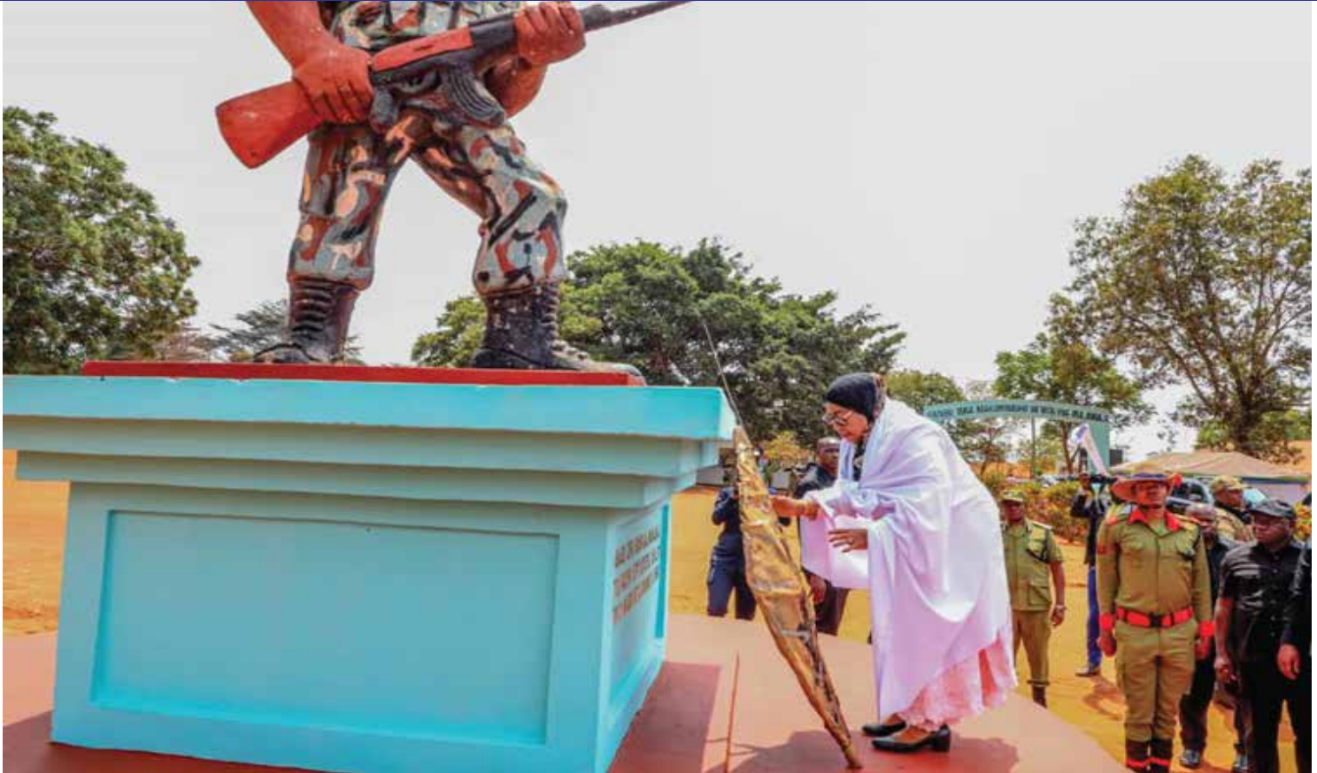
The President of the United Republic of Tanzania H.E. Dr. Samia Suluhu Hassan honoring memory of Majimaji War Heroes on 20th September 2024