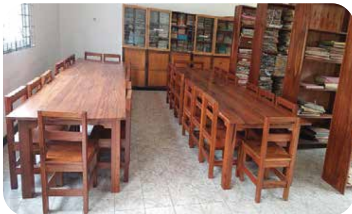
Library services @Arusha Declaration Museum, Arusha Museum and House of Culture, Dar es Salaam,