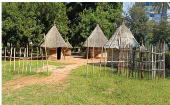
Traditional House@Village Museum, Dar es Salaam