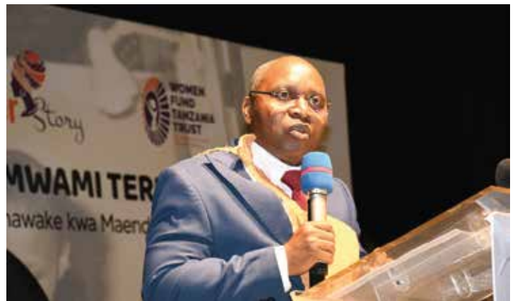
The Minister of Culture, Arts and Sports, Hon. Dr. Damas Ndumbaro (MP) addressing the participants during the celebration of Mwami Ntare II

Minister of Culture, Arts and Sports, Hon. Dr. Damas Ndumbaro (MP), announced that plans are underway to construct the Mwami Tereza Ntare Museum in Kigoma. "This museum will honour the women who contributed to Tanzania's liberation," he said, during the event's peak celebration. The Minister also launched a one-month exhibition chronicling Mwami Ntare's life.