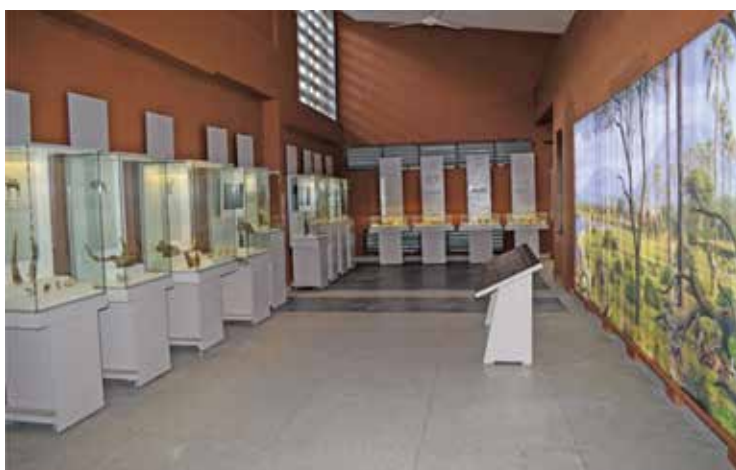
Human Evolution gallery@Museum and House of Culture, Dar es Salaam