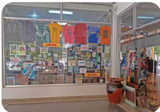
Curio shop@Museum and House of Culture