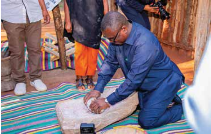
Hon. Jumanne Sagini (MP) participated in the food processing experience at Sabasaba Exhibition

Deputy Minister of Constitution and Law, Hon. Jumanne Sagini (MP), lauded the display celebrating the Wazanaki tribe, particularly the traditional houses and cultural artifacts originating from Butiama, Mara Region. "I was especially moved to see the ancestral tree-bed and participate in traditional food preparation," he shared, encouraging all Tanzanians to explore these vital cultural narratives.