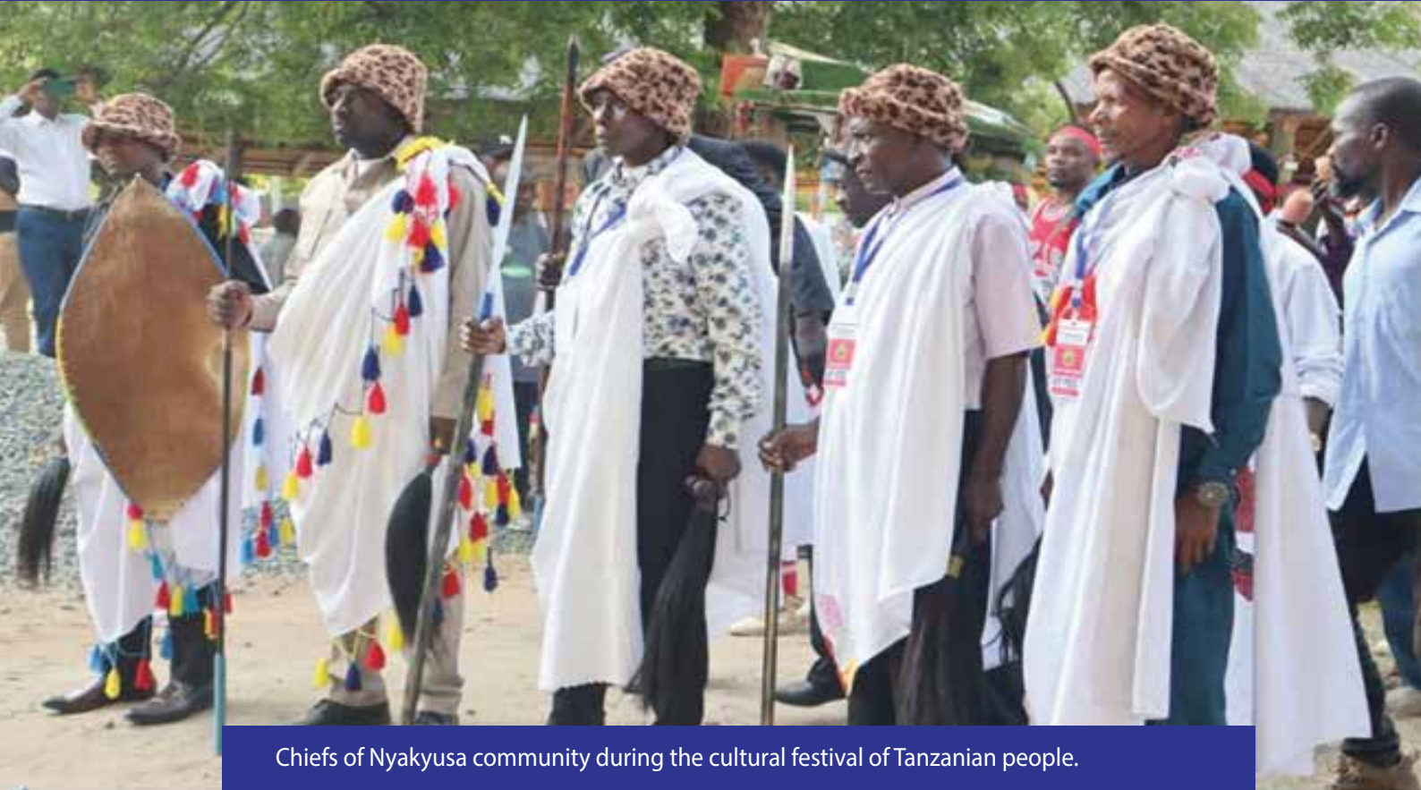
Chiefs of Nyakyusa community during the cultural festival of Tanzanian people.