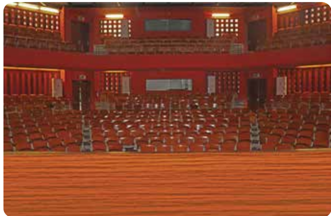
Theatre for Hire @Museum and House of Culture. Dar es Salaam (460 capacity)