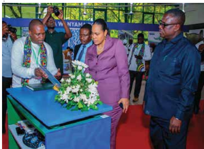
Hon. Angellah Kairuki, the Minister for Natural Resources and Tourism speaking at the official opening

The Minister for Natural Resources and Tourism, Hon. Angellah Kairuki (MP), together with Hon. Jumanne Abdala Sagini and Hon. Eng. Ezra John Chiwelesa (MP), toured the MNRT pavilion, commending its cultural tourism initiatives.