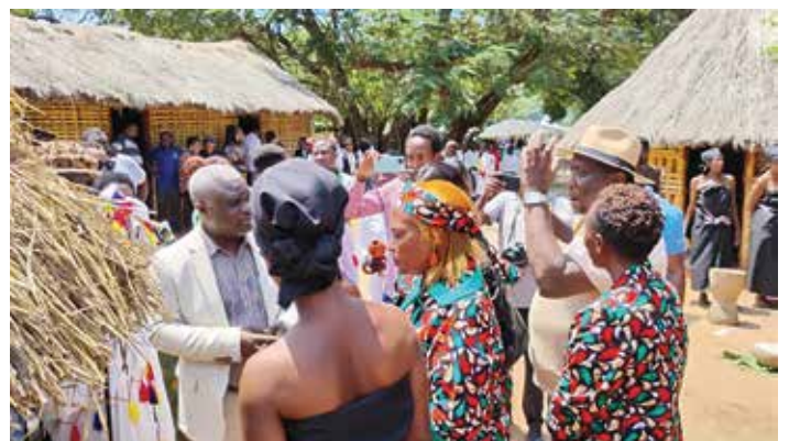
The Patron of the Festival, Arch. Elius Mwakalinga, the former Permanent Secretary of the Ministry of Construction and Transport receiving information about traditional houses

She highlighted the educational value of traditional homes, clothing, and foods featured at the festival, urging Tanzanians to visit the Village Museum to experience tribal architecture and lifestyle firsthand.