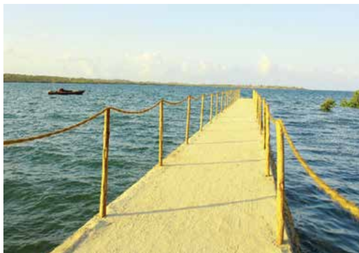
Mikindani Old Town