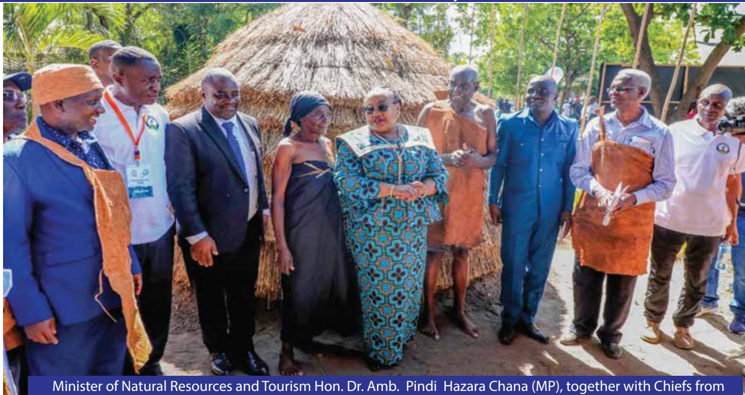
Minister of Natural Resources and Tourism Hon. Dr. Amb. Pindi Hazara Chana (MP), together with Chiefs from Kigoma communities